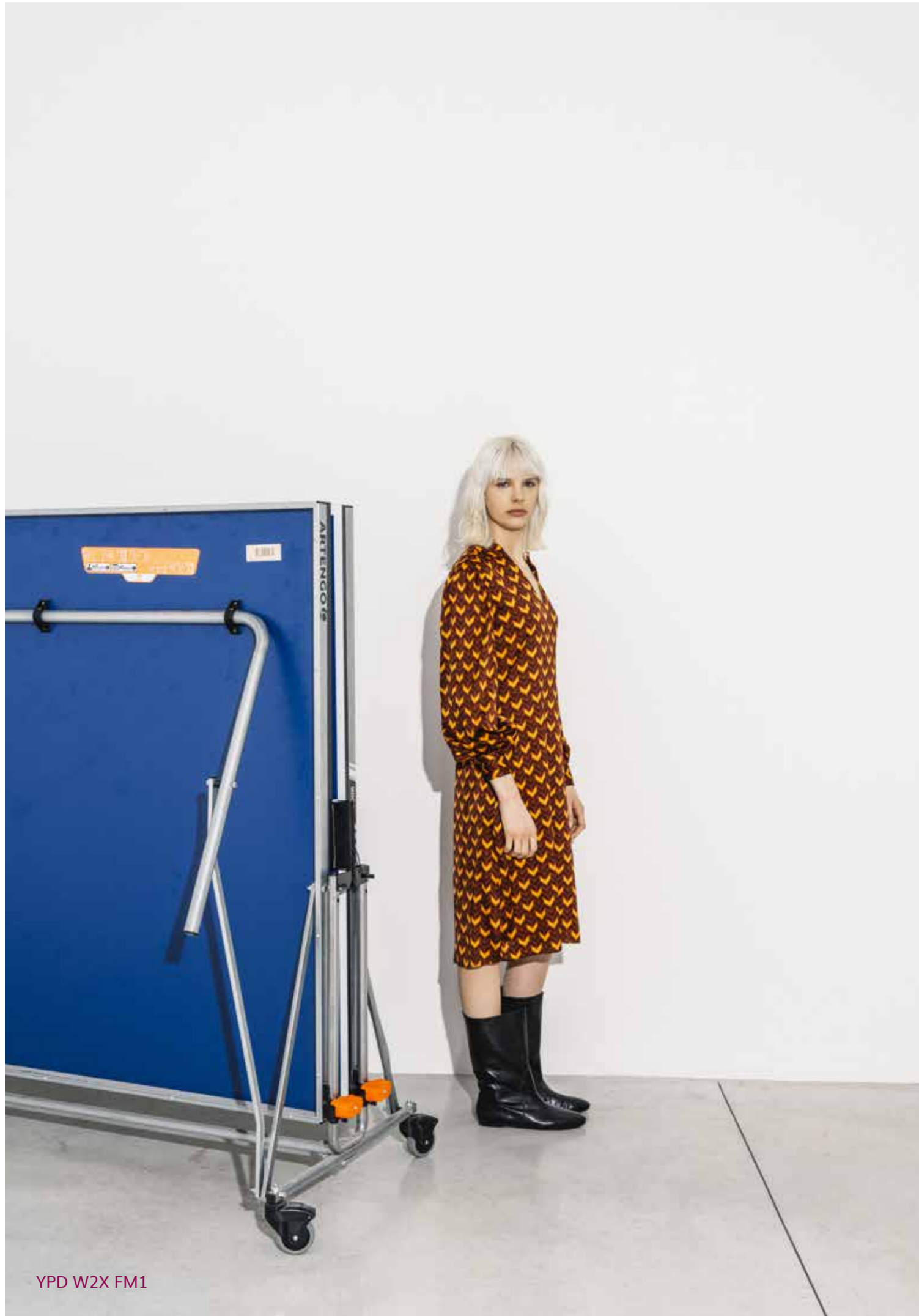
YPD W2X FM1