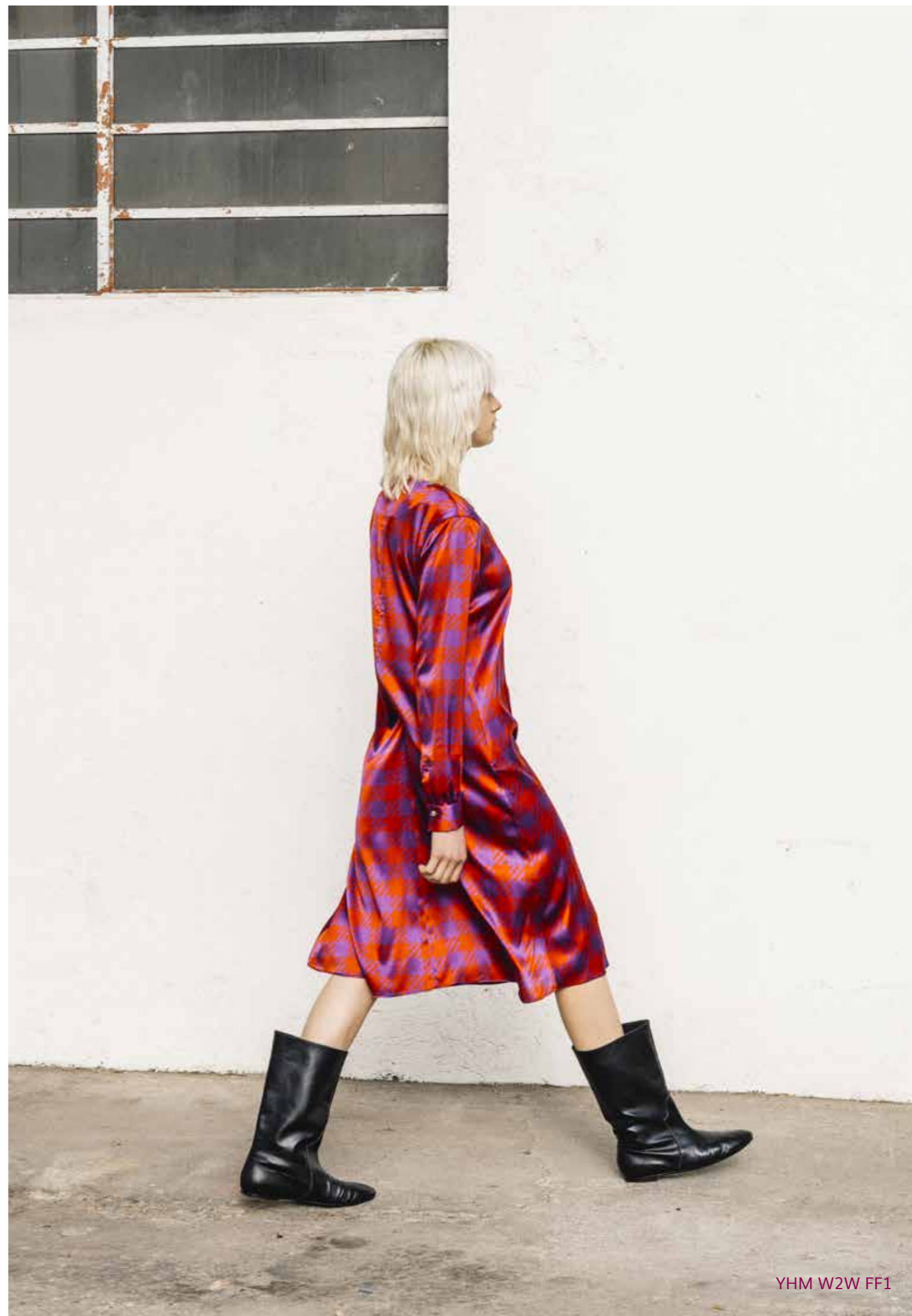
YHM W2W FF1