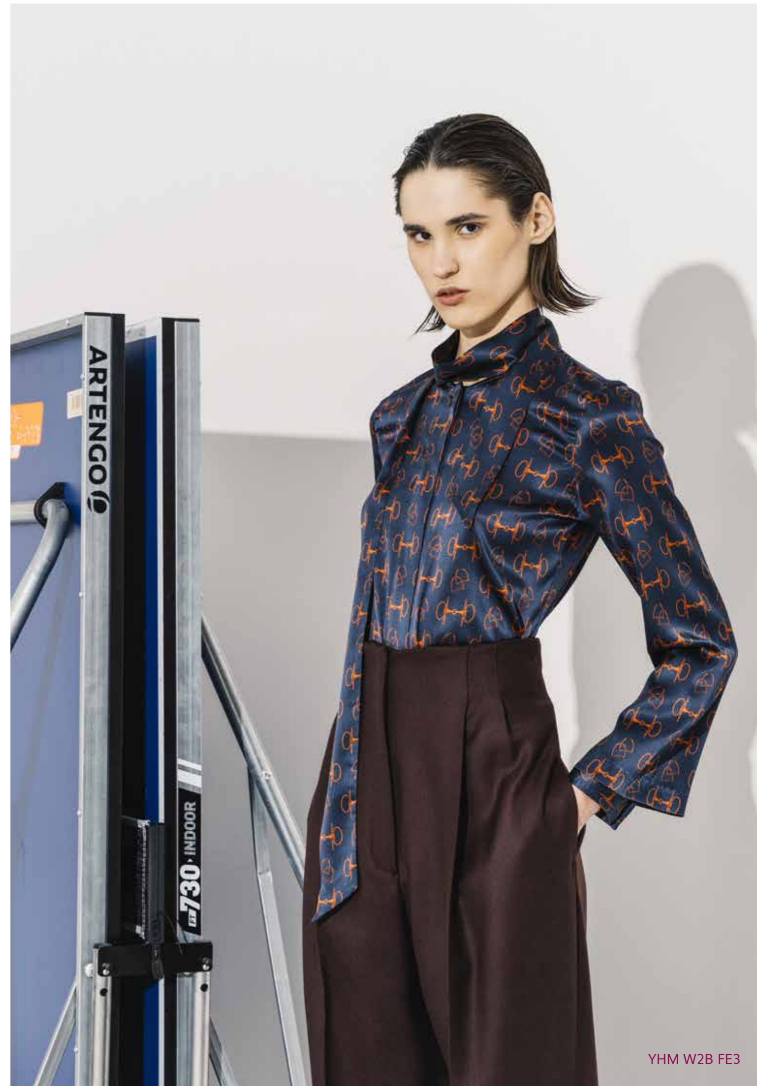
YHM W2B FE3