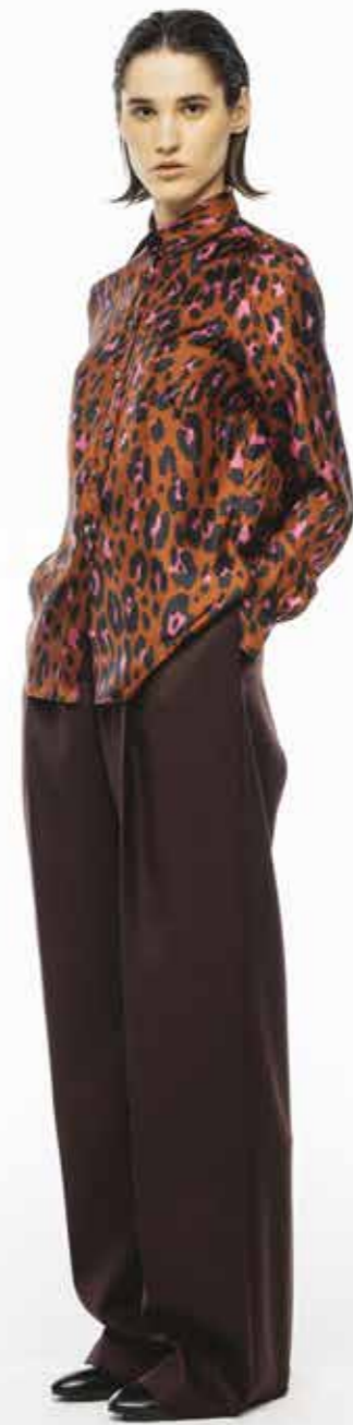
YMR W2P FQ2