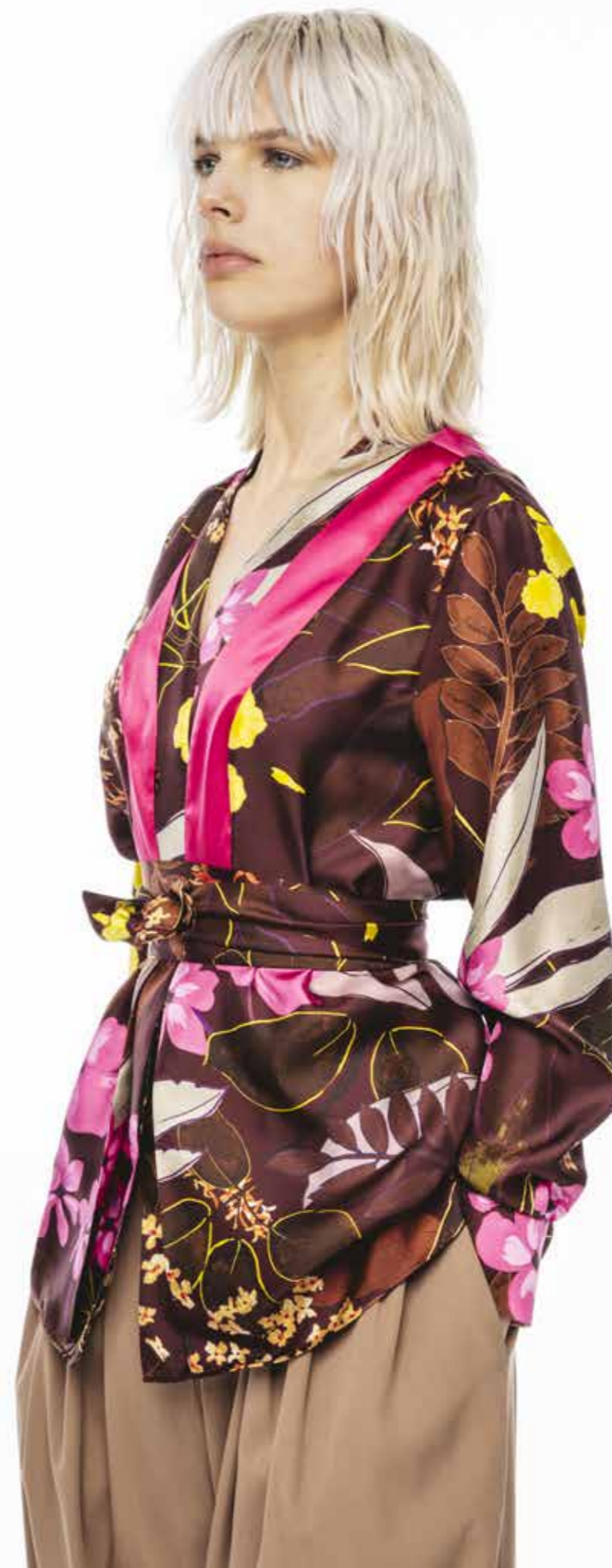
YMR W2T FJ1