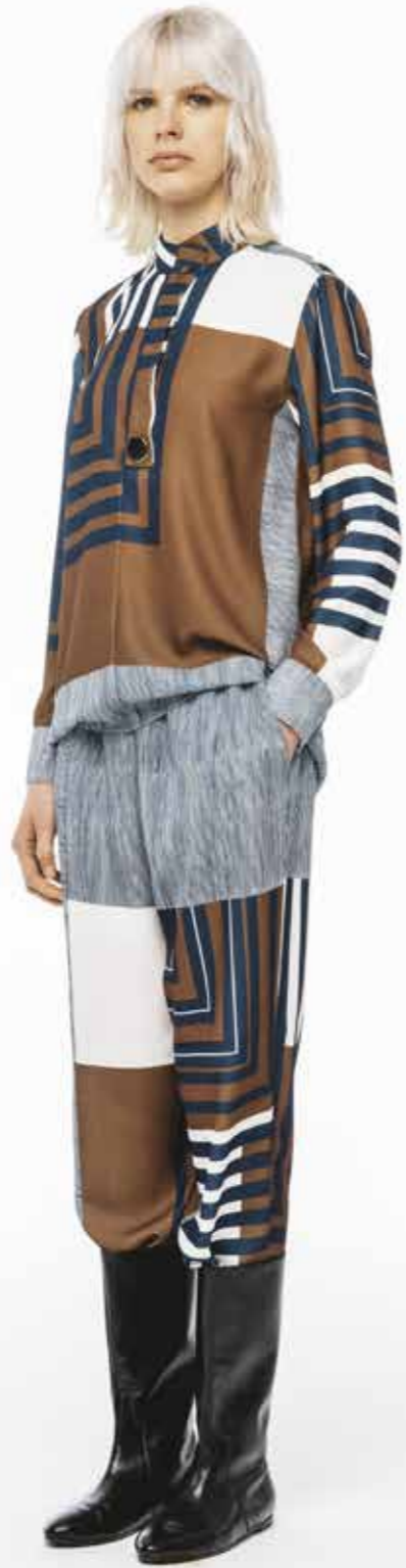
YRV W3F FE1