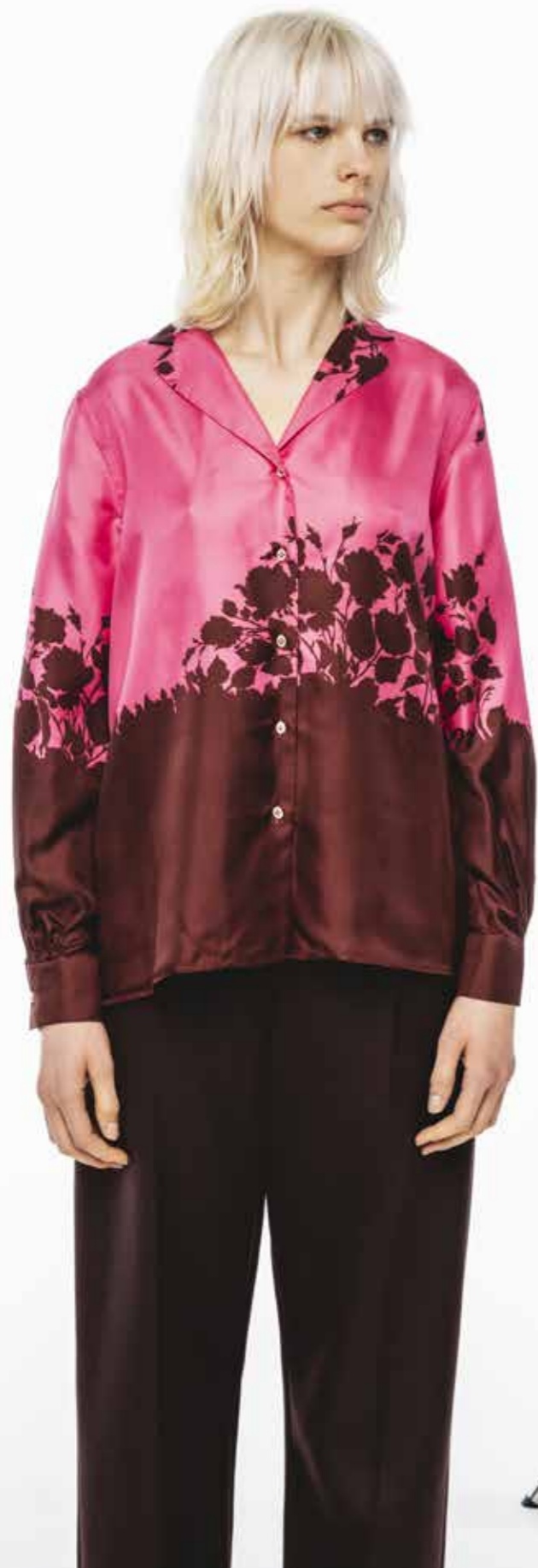
YRT W2U FJ1