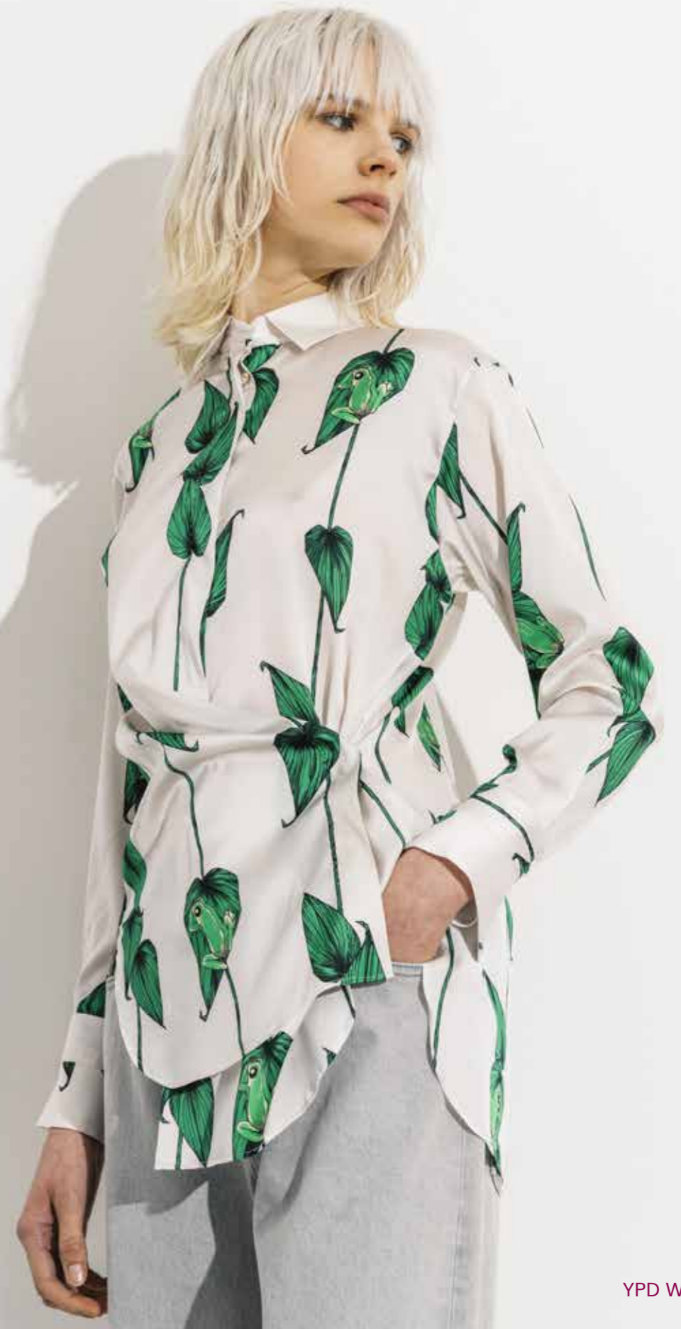
YPD WVU FT1