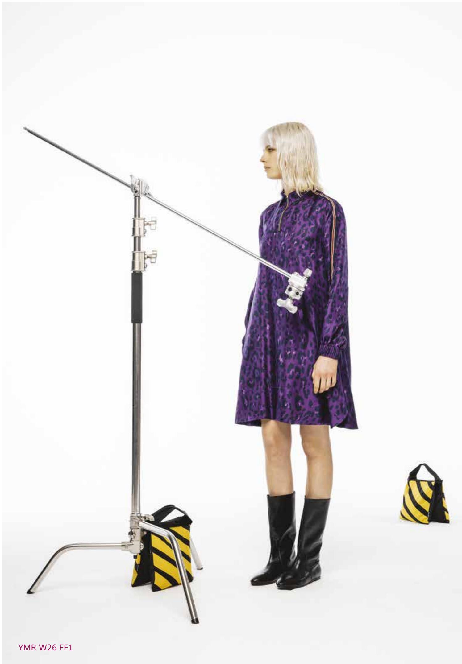
YMR W26 FF1