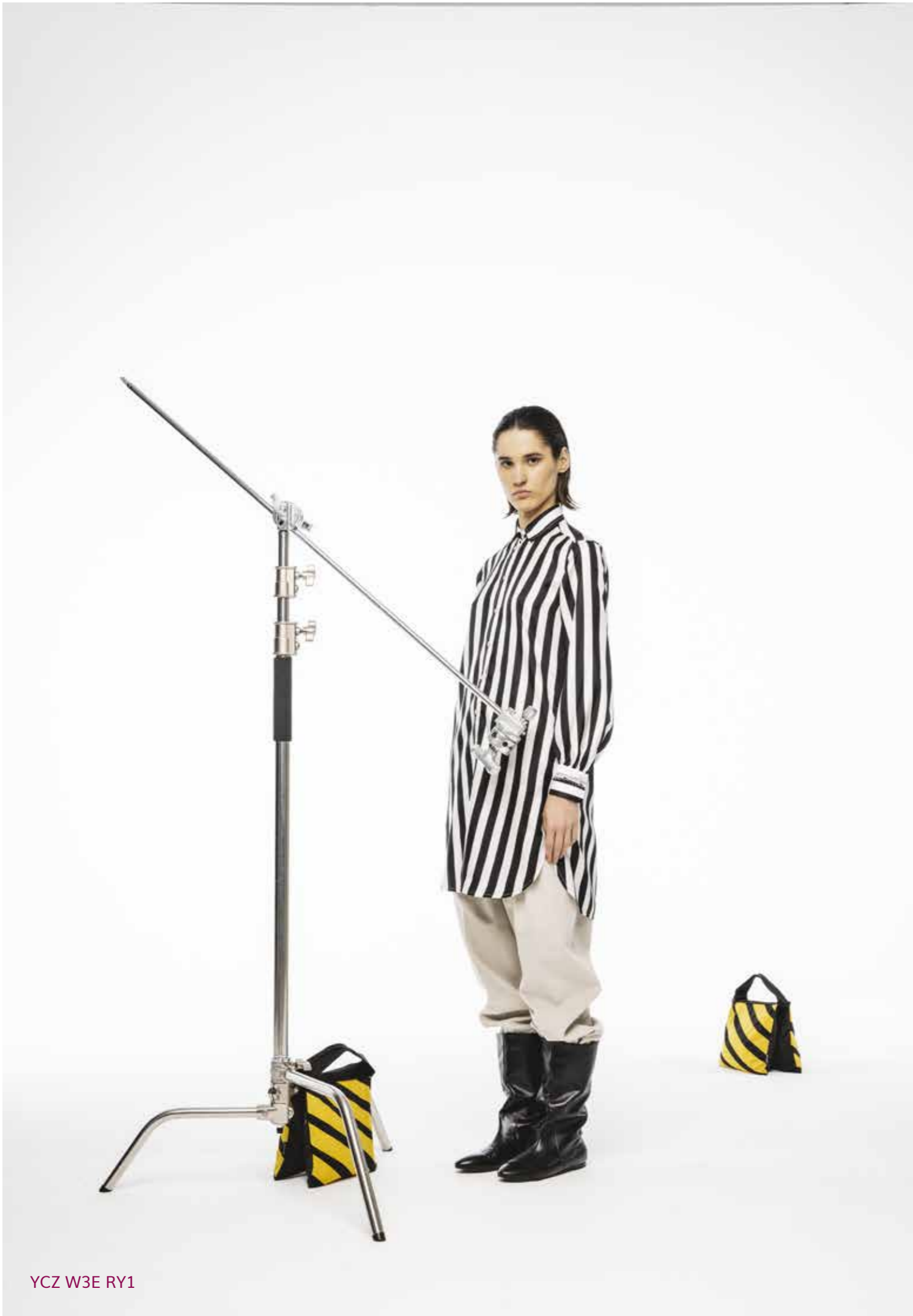
YCZ W3E RY1