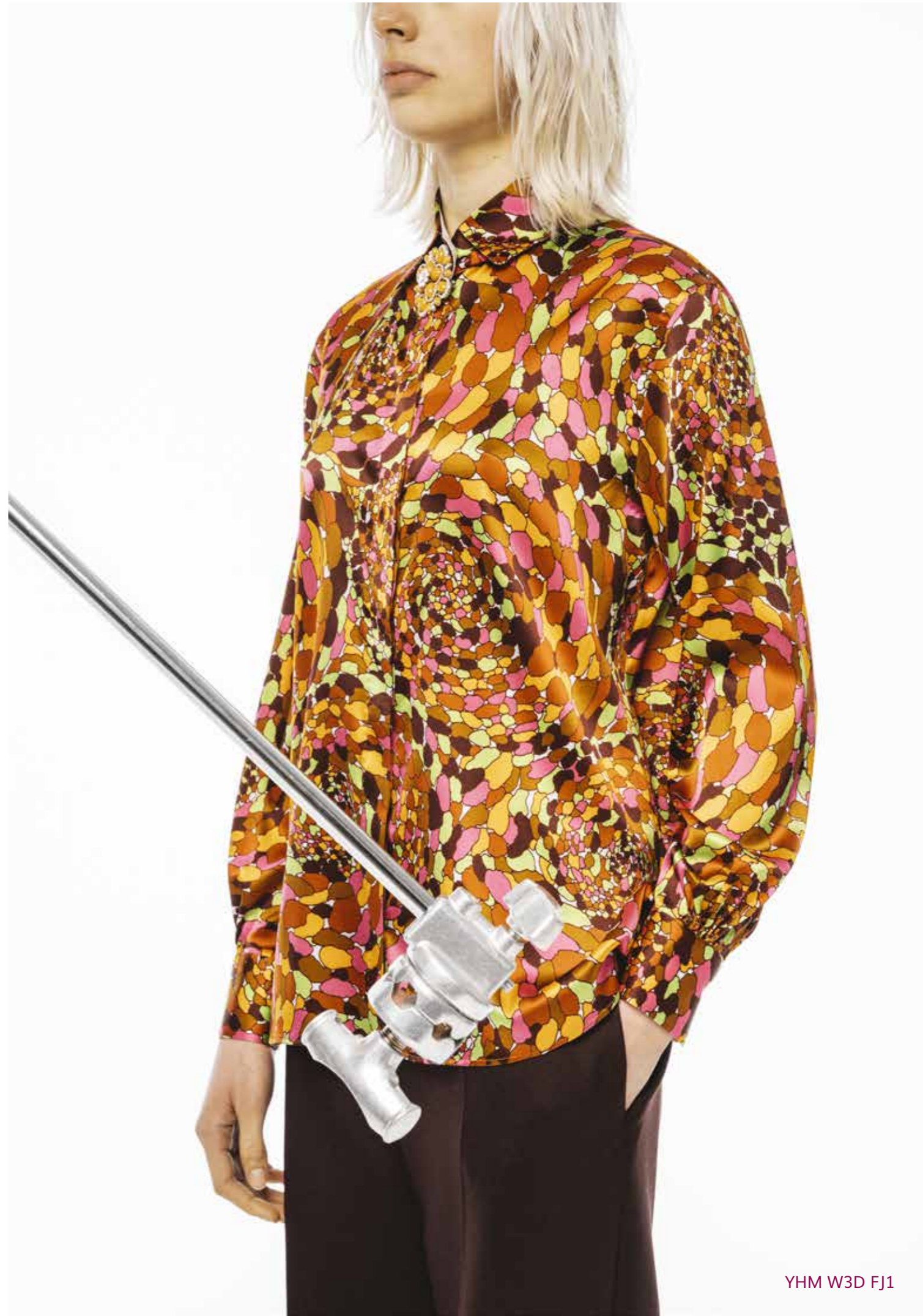
YHM W3D FJ1