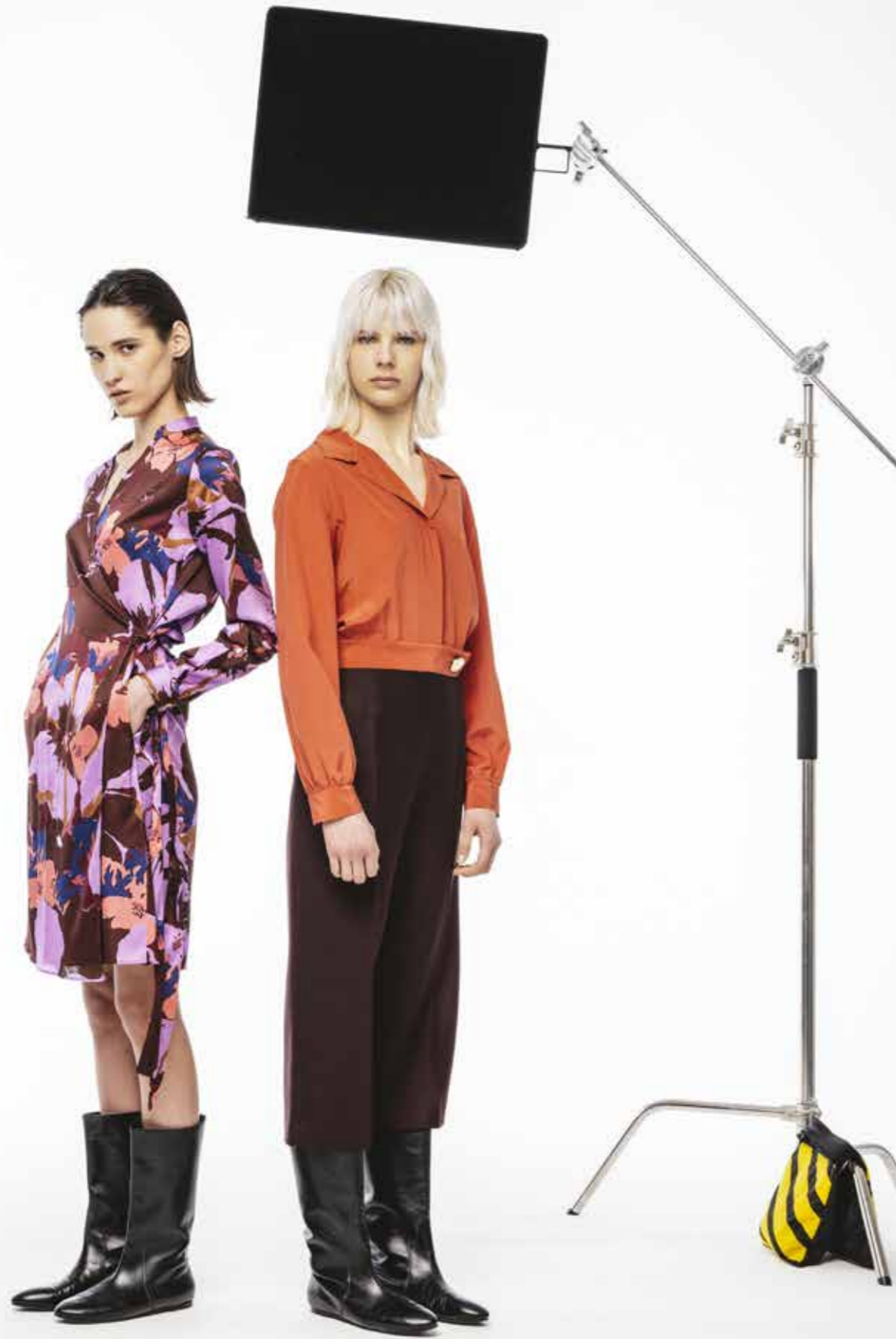
YPD W2Y FJ1