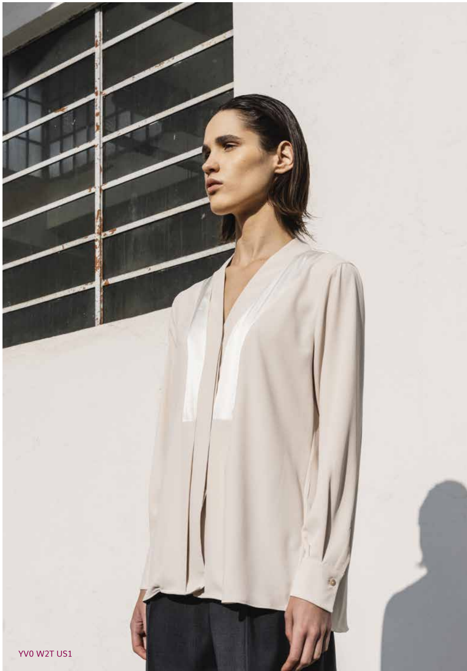
YV0 W2T US1