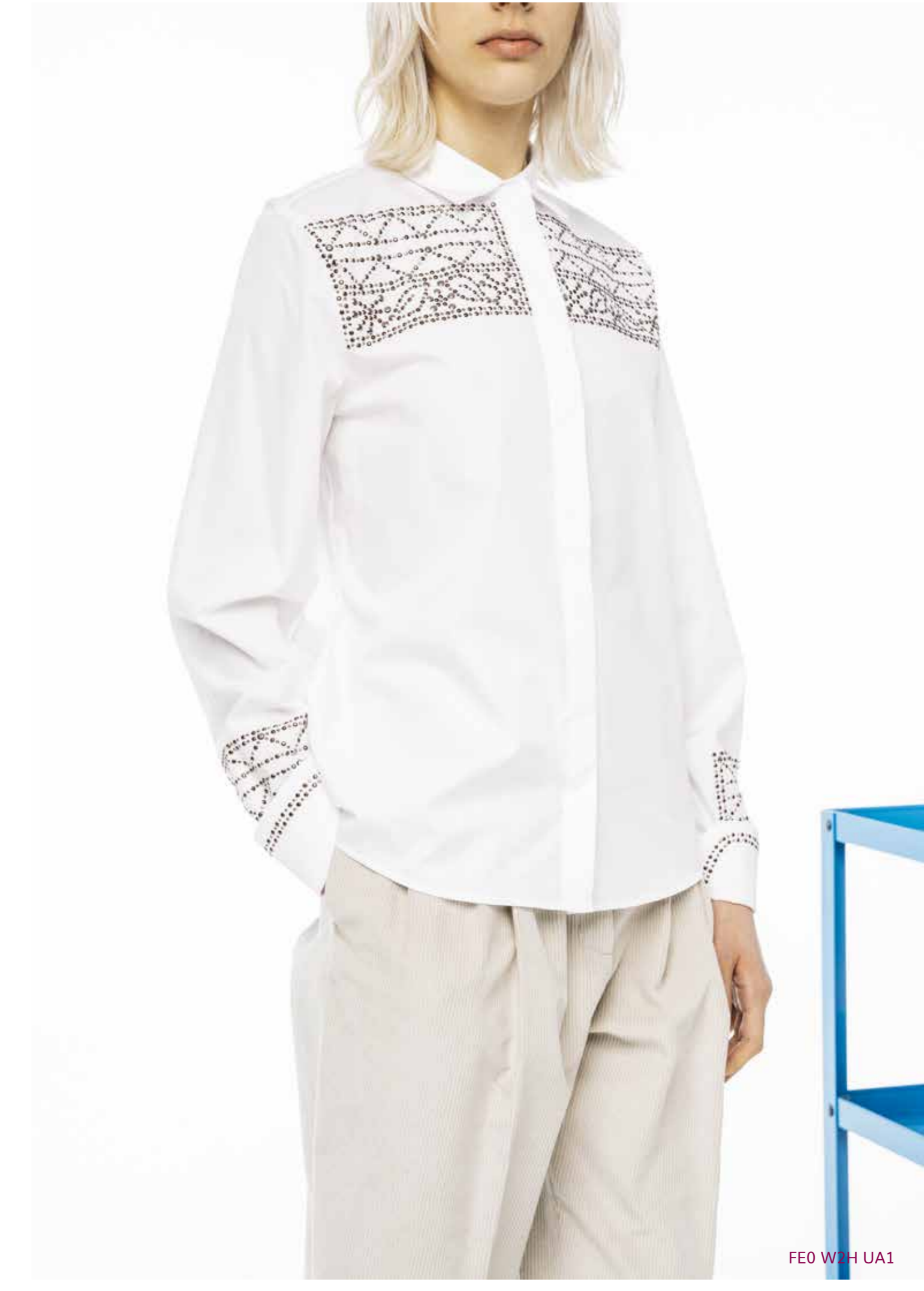
FE0 W3H UA1