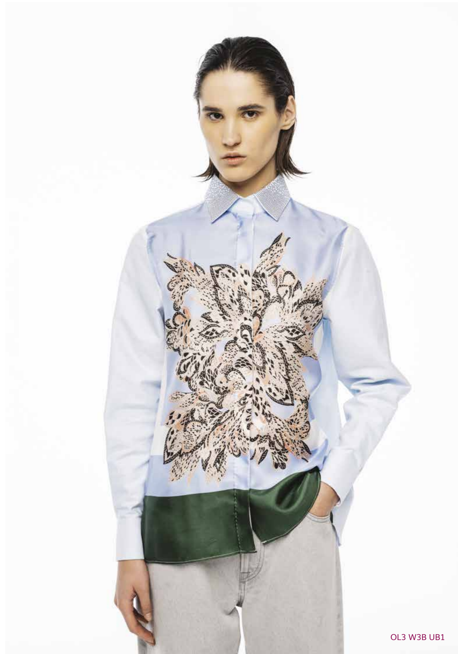
OL3 W3B UB1