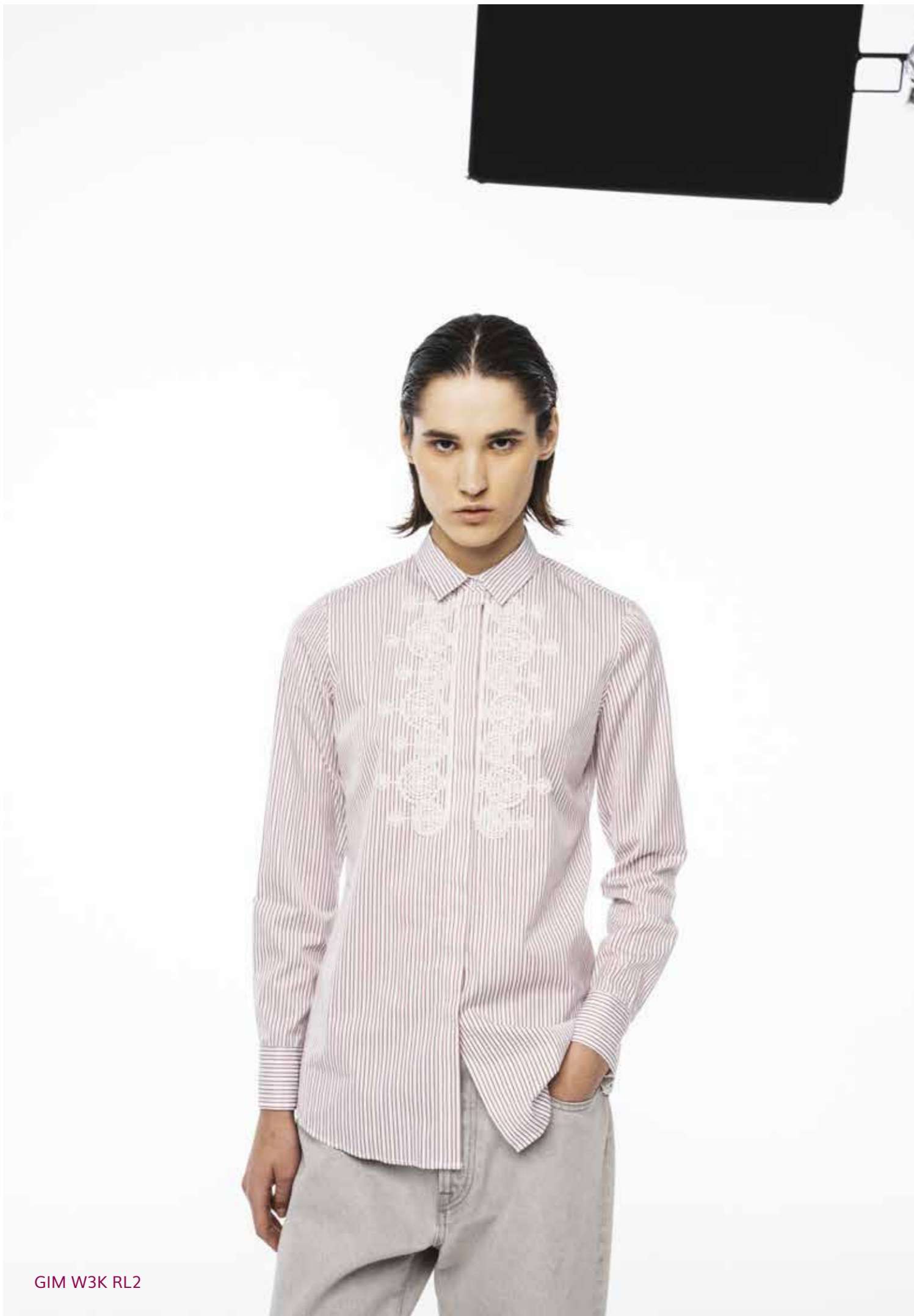
GIM W3K RL2