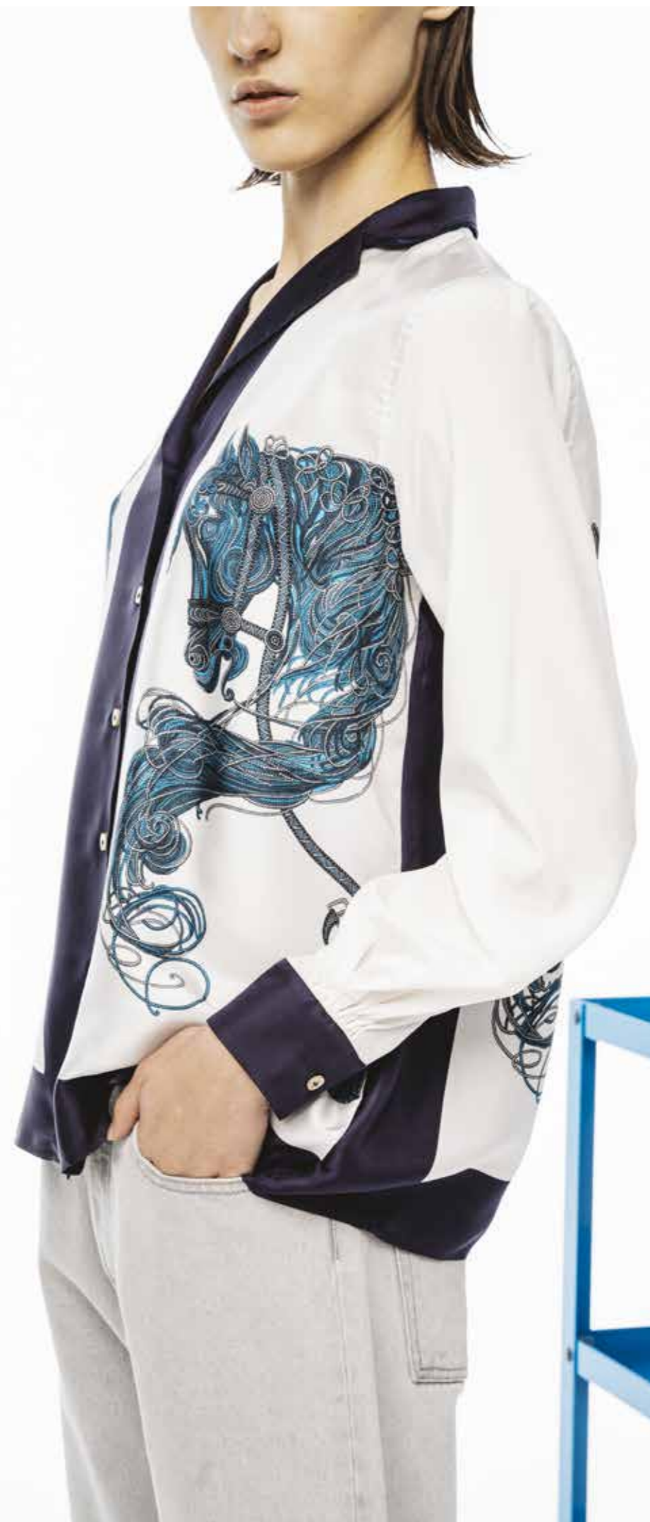
YRT W3P FE2