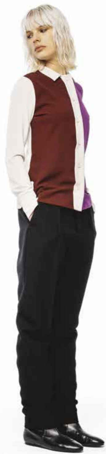
YV0 W3J US1