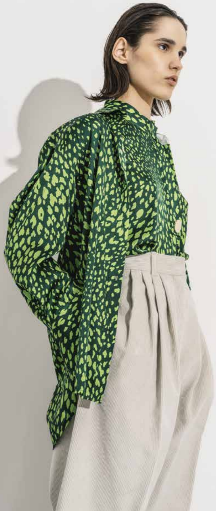
YPD W2K FT2